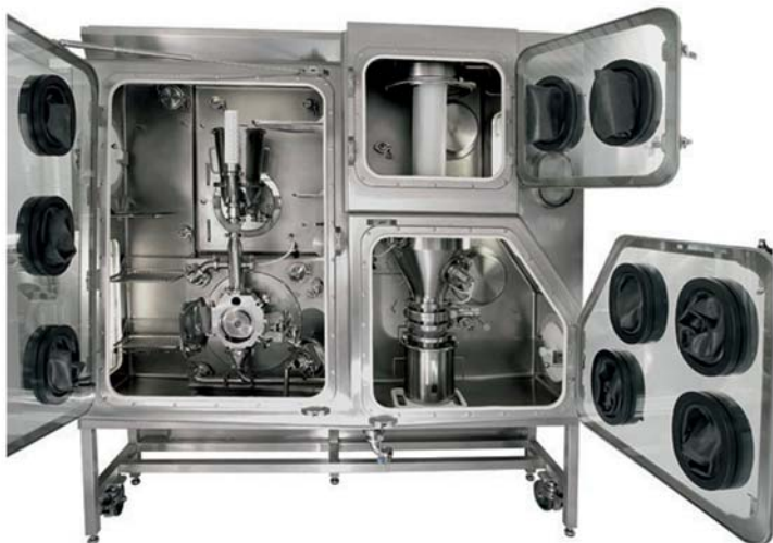
Contained Milling System