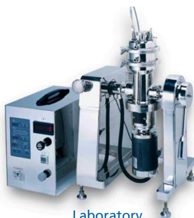
Laboratory Particle Engineering