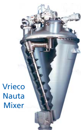
Vrieco Nauta Mixer