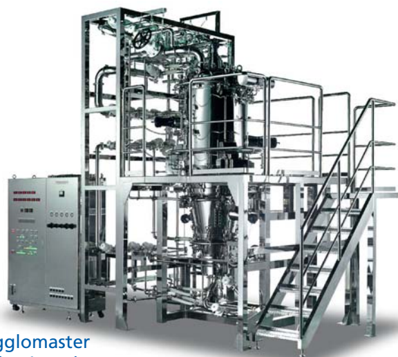
Agglomaster Production Plant